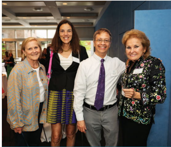
Donors gather to celebrate QUNO's 75th anniversary

As a non-profit organization that relies on the generosity of individuals and organizations to finance its work, we are grateful for donations of any size. Donation details can be found below. Contact our offices with questions about leaving a legacy.