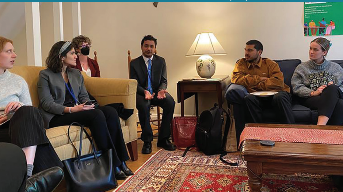
Youth participants meet at Quaker House

In 2024, QUNO will continue to bring UN actors together so they can better understand the complexities unfolding on the ground in Myanmar. By providing this space, QUNO ensures that diplomats and UN staff have the information needed to formulate responses that protect civilians and support leaders working for long-term peace.