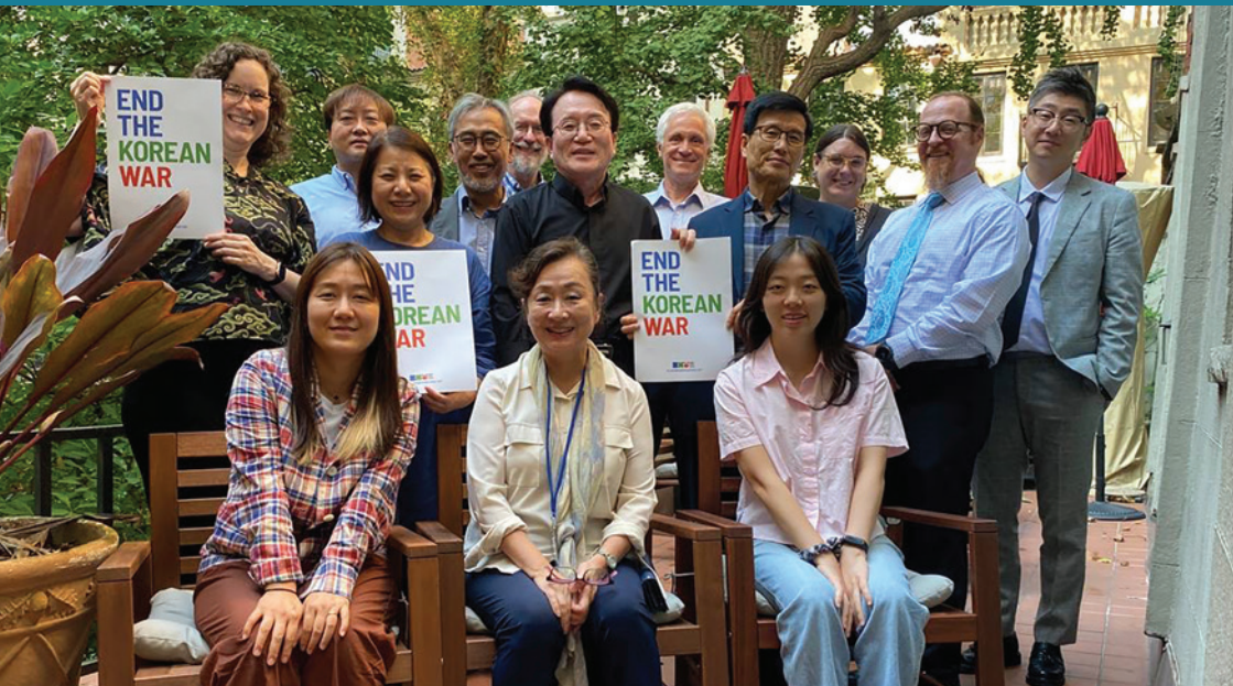
QUNO staff and guests on the Quaker House terrace

Through this new focus, QUNO has created bridges, allowing young people to advocate directly at the UN for themselves and their communities. Collaboration has been a critical ingredient in this new work, and QUNO has partnered with other Quaker service agencies, such as the American