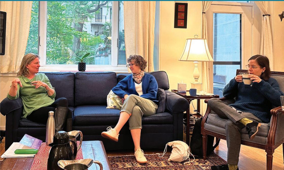
QUNO New York and Geneva staff discuss linkages in their work on climate change

Through collaboration between New York and Geneva staff, QUNO convened diplomats to consider this challenge. Informal and off-the-record conversations provided a space to highlight the need for flexibility, inclusive decision-making, long-term actions, international cooperation, and greater coordination across sectors. Meeting participants agreed that international actors must do more to ensure the delivery of international development assistance and the growth of climate-resilient peacebuilding strategies.