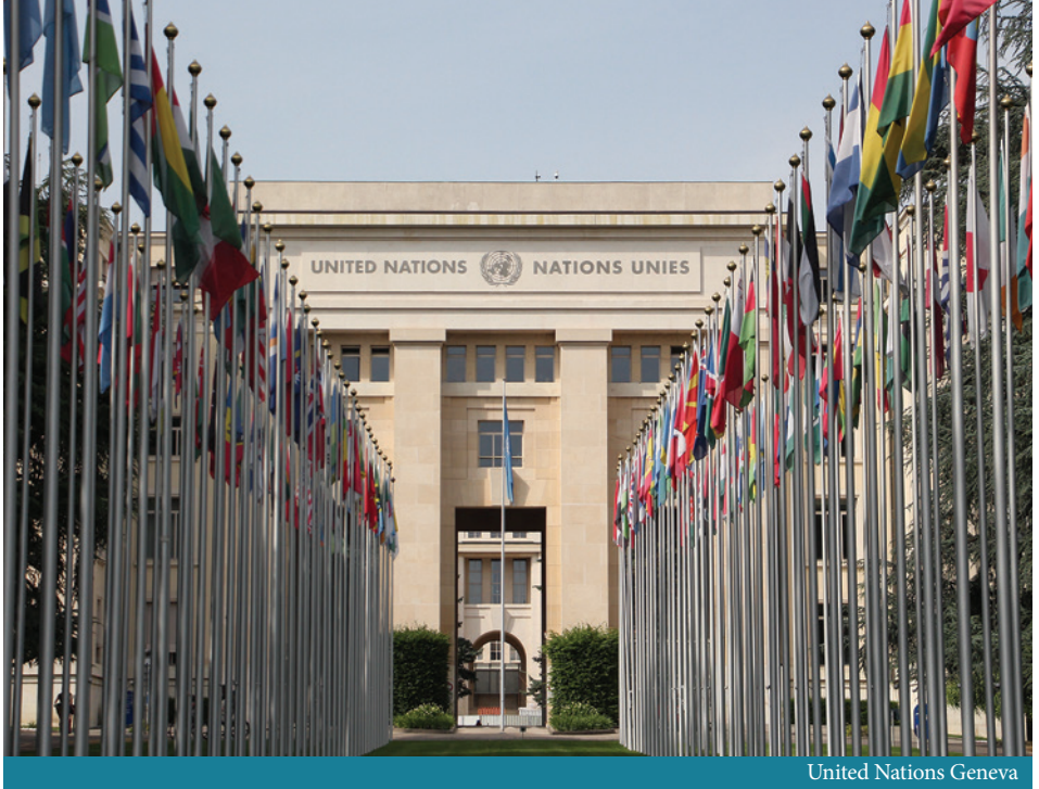
United Nations Geneva