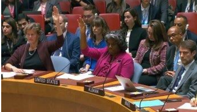
Ambassadors for the UK (left) and the US (centre) veto a UN Security Council resolution calling for a cease-fire in Gaza.

Work at the United Nations (UN) over the last few years has been difficult. Many countries, including those with great power and influence, have ignored the basic principles of international law, and they have not lived up to their commitments under the UN Charter. As a global community, we face serious challenges - from climate change to the ongoing impact of COVID-19, to food insecurity and massive inequalities. There are now wars taking place on almost every continent in