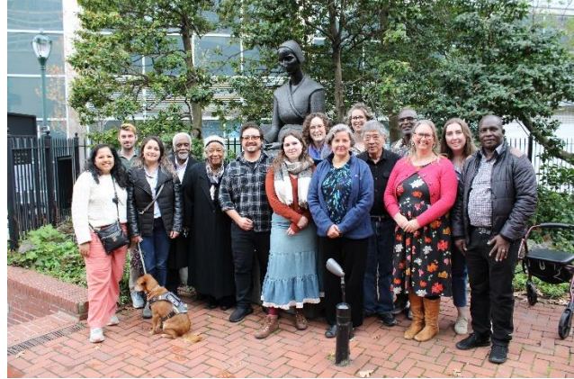
Members of the Quaker UN Committee, New York and staff visit Friends Center in Philadelphia.

The work of both offices is made possible through generous support and collaboration between FWCC, AFSC, as well as Britain Yearly Meeting. We also depend on the gifts of many individuals, and Quaker Meetings.