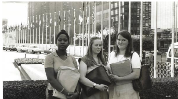
Programme Assistants at the UN in New York during the early 1970s.

In this context, the staff of QUNO in New York and Geneva work with the UN to uphold the dignity and worth of every person so that peace can flourish. Our job is to always listen and push so that the UN can overcome the divisions and countries will respect and uphold the original vision of the UN. This is how QUNO strives every day to make a more just and peaceful world as a Quaker presence at the UN. And this has been our work for over 75 years