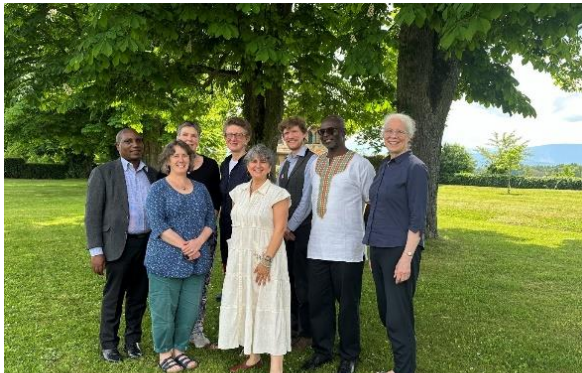
Members of the Quaker UN Committee, Geneva, meet at Bossey, Switzerland

Both our New York and Geneva offices represent the worldwide community of Quakers at the United Nations on behalf of the Friends World Committee for Consultation (FWCC). Priorities for each office are set by a committee that includes representatives appointed by FWCC.