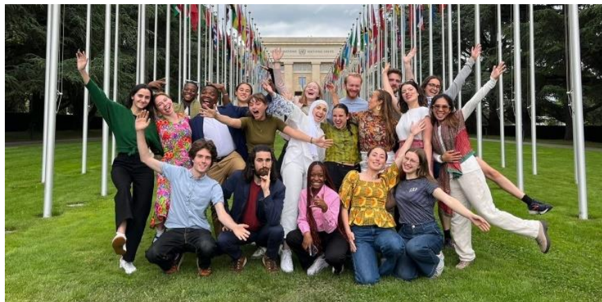
Participants in the July 2024 Summer School in Geneva.

If you want to stay connected and know more about QUNO's work, be sure to sign-up to receive our monthly e-newsletter and follow us on Facebook , X , and LinkedIn .