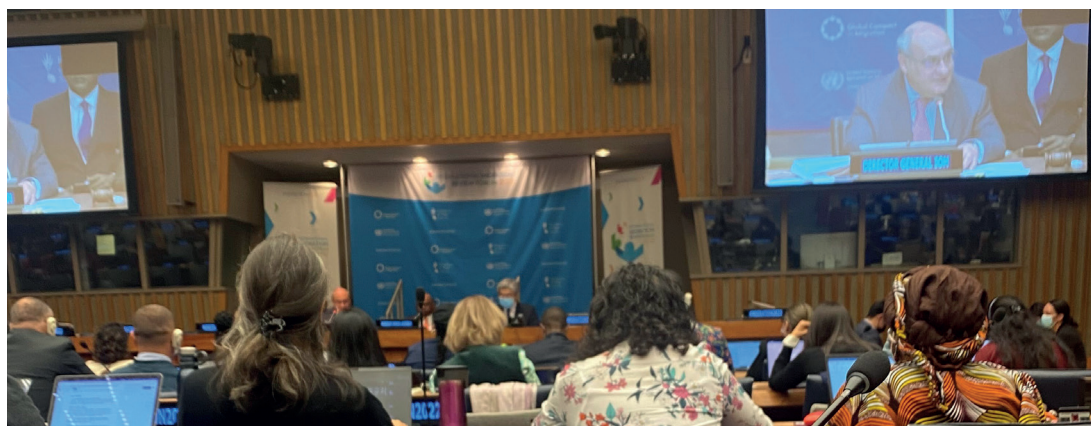
António Vitorino Director General of the International Organization for Migration at the opening of the IMRF Multi-Stakeholder Hearing.