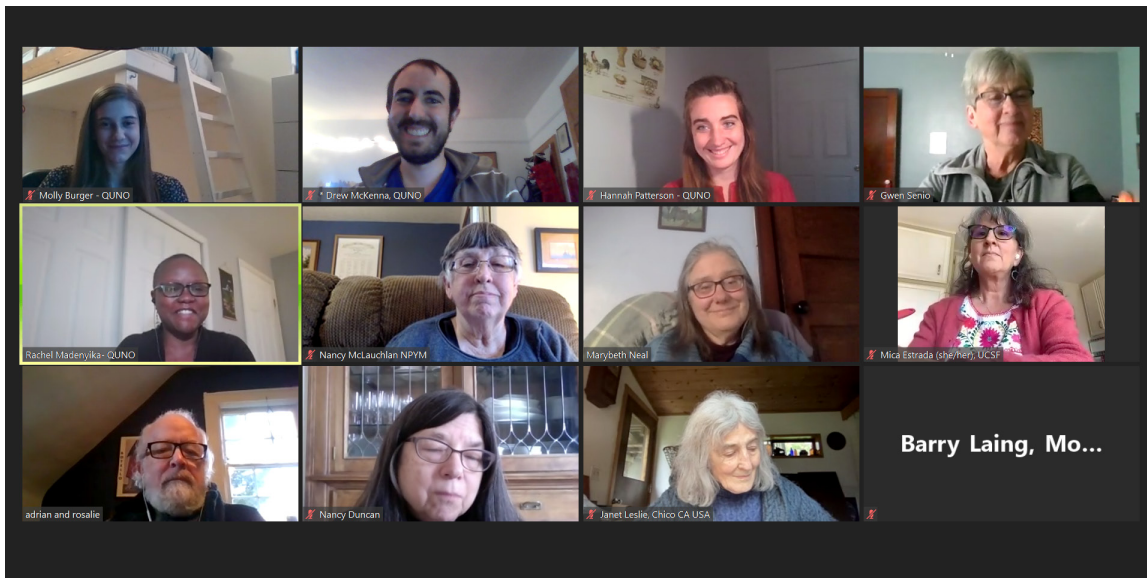
QUNO Program Assistants hold a virtual interest group at FWCC Section of the Americas biannual Meeting.