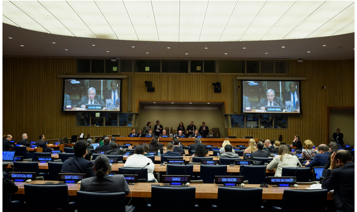
Peacebuilding Commission meets on 2020 Review of Peacebuilding Architecture.