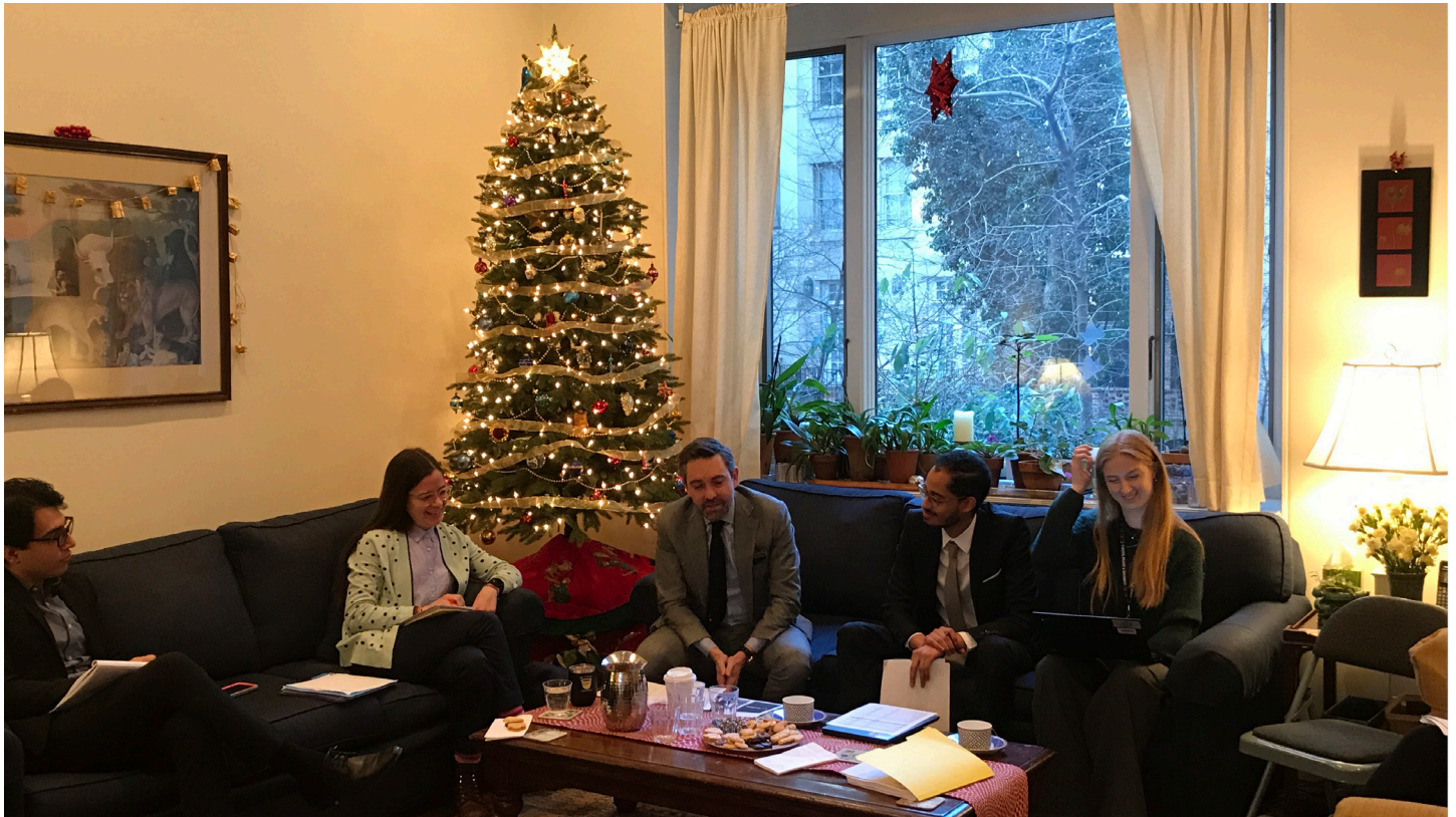
QUNO staff and participants at Quaker House.