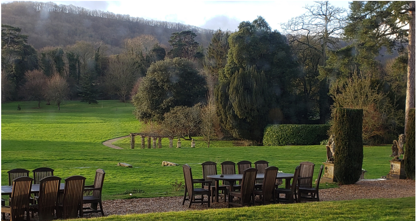
Beautiful grounds of Wilton Park.