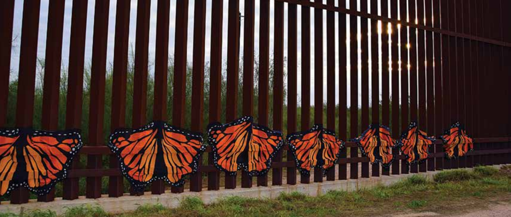
Protesters decorate a section of the border fence between Donna, Texas and Rio Bravo, Mexico