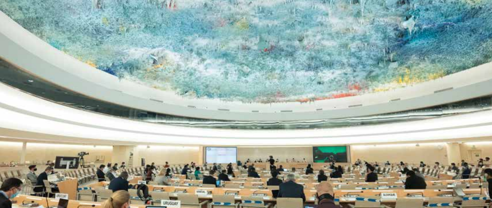
Masked and socially distanced delegates attend the 45th session of the Human Rights Council