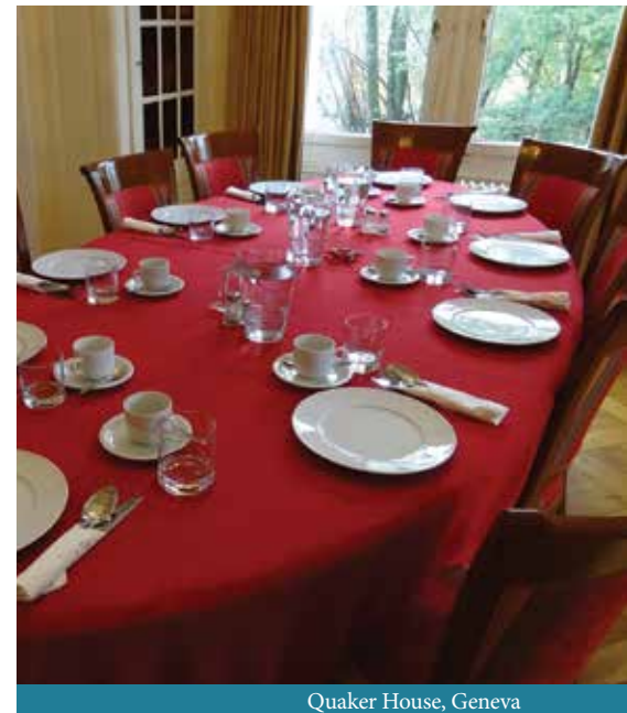
Quaker House, Geneva

As a non-profit organization that relies on the generosity of individuals and organizations to finance its work, we are grateful for donations of any size. Donation details can be found below. Contact our offices with questions about leaving a legacy.