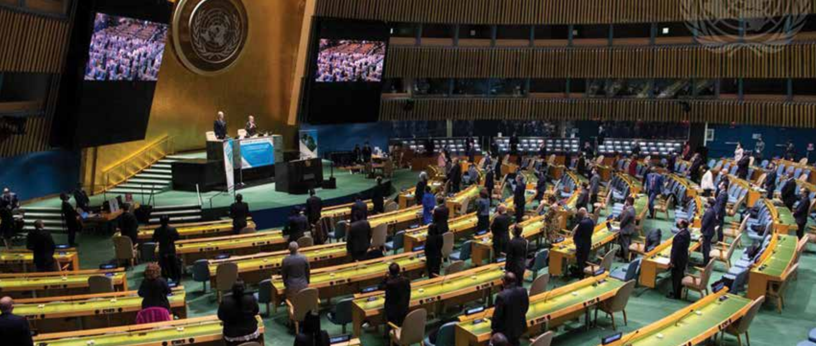
General Assembly holds special session in response to COVID-19 Pandemic