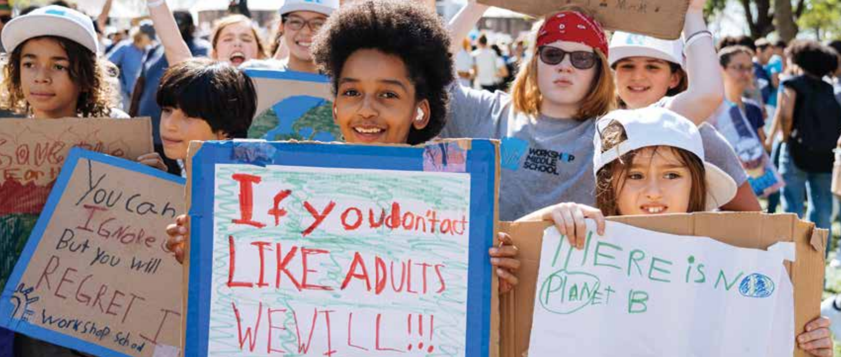
Youth participate in a climate strike in New York City