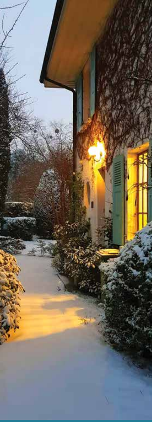
Quaker House, Geneva