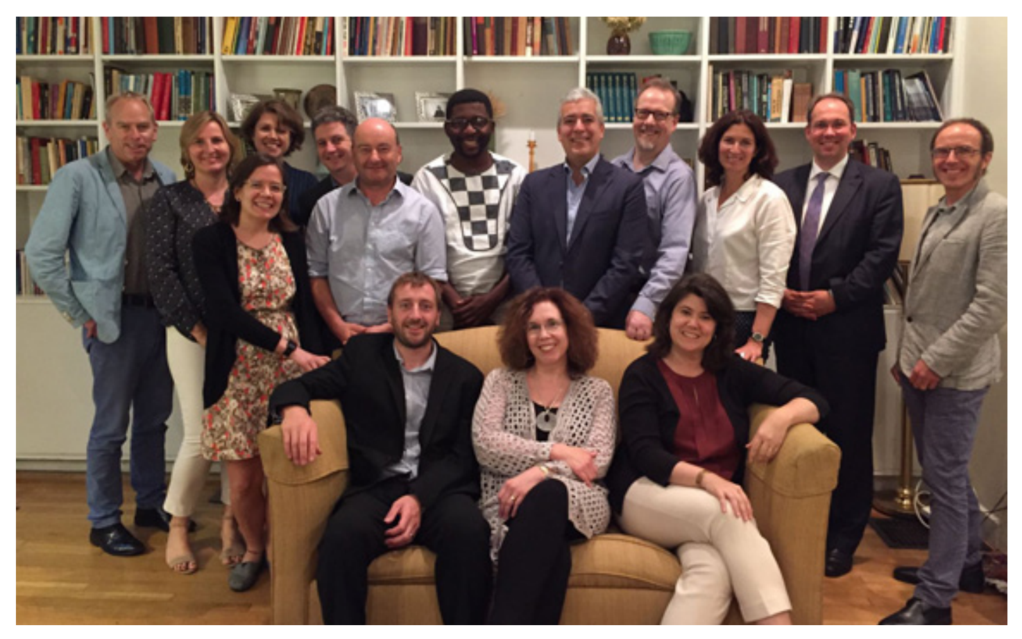
Colleagues gather for "What's next in peacebuilding" at Quaker House.