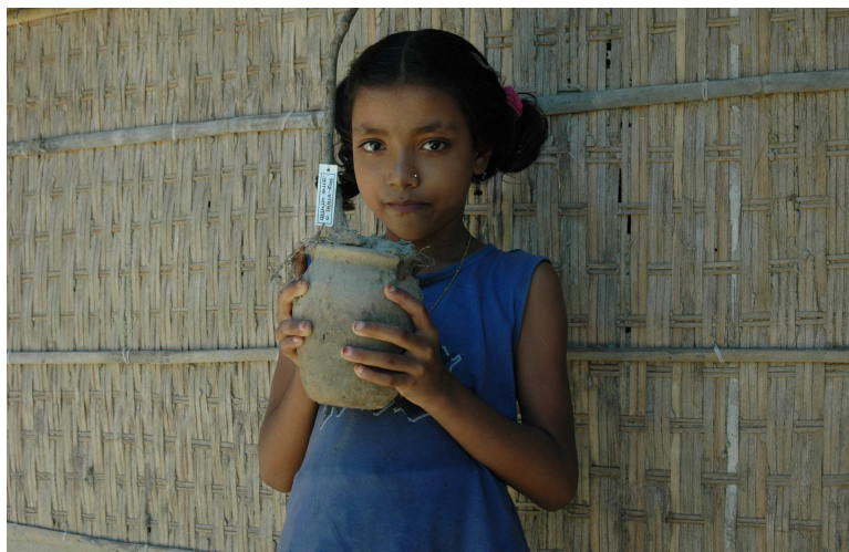
The future in her hands: Planting fruit trees for food and the environment

To read more about GEI activities in 2010, please visit our website at www.quano.org/economicissues/default.htm