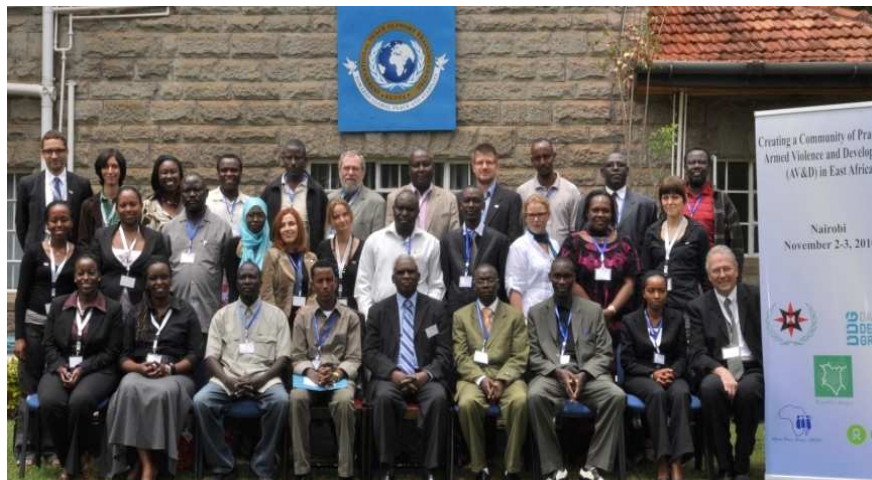
Geneva Declaration Civil Society Regional Conference in Nairobi in November 2010

Quaker United Nations Office, Avenue du Mervelet 13, 1209 Genève, Switzerland, Tel: +41 22 748 48 00 Fax: +41 22 748 48 19 Website: www.quno.org