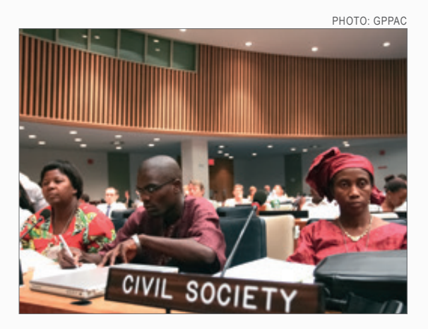
Civil society at the UN General Assembly as part of the Global Conference , 2005.