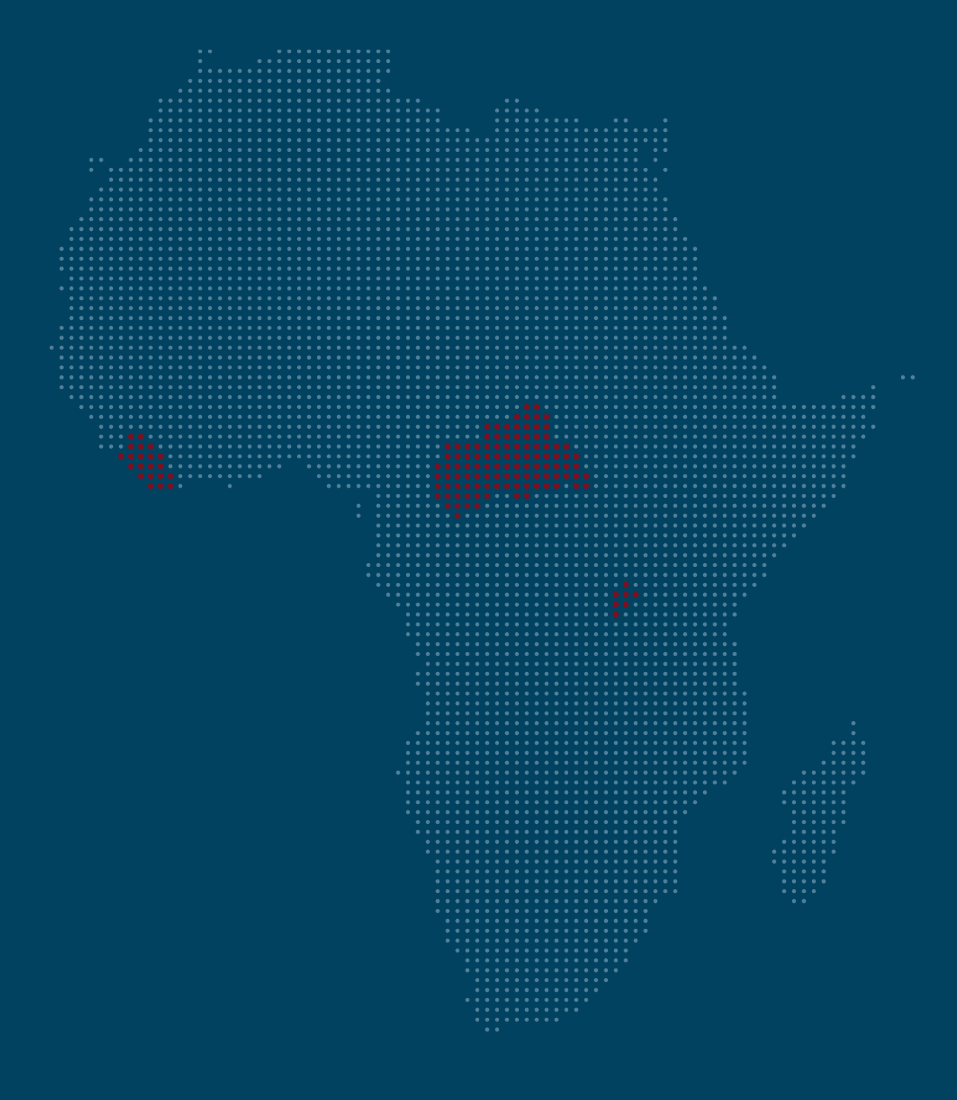
Project funded by the Ministry for Foreign Affairs, Sweden