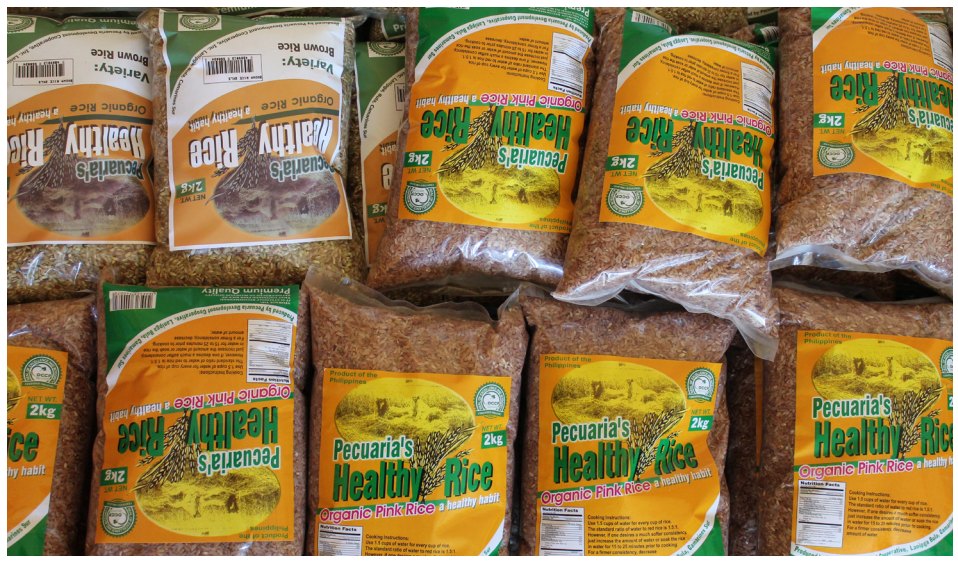
Organic rice from Pecuaria are sold on major department stores distributed by Global Organic and Wellness Corp.