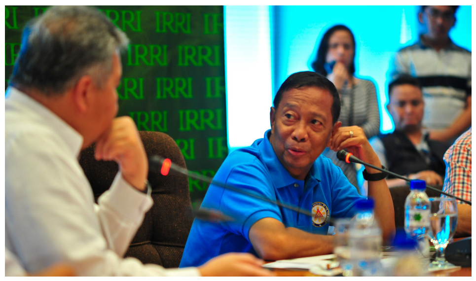
Philippine VP Jejomar Binay visit to IRRI, 2015, International Rice Research Institute (IRRI).

required to disclose the parental lines used and the geographical location where they originate, including any knowledge of prior art. When individual farmers or communities register varieties they become eligible to share in the revenue collected from the sale and registration of these varieties.<sup>70</sup>