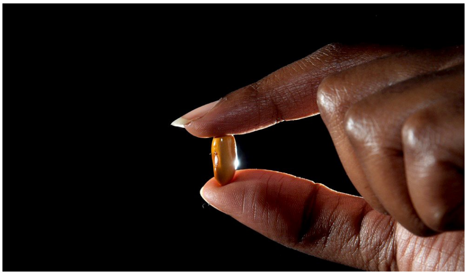
The so-called "Enola" yellow bean variety that has been at the centre of a decade-long biopiracy case

within the private sector and support public sector research targeting the needs of poor farmers who lack the ability to pay for commercial varieties. The accessibility of this information, however, is the subject of much debate.<sup>36</sup>