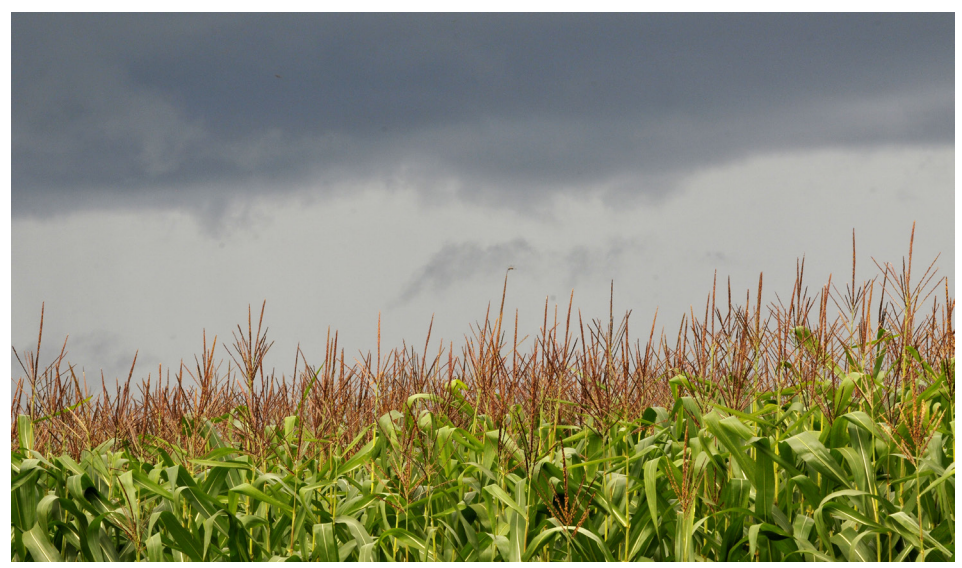
Maize, Neil Palmer (CIAT).

narrowing of crop gene pools.55 PVP is granted for genetically uniform, stable varieties: homogenous varieties with characteristics that remain unchanged after repeated propagation (Article 8, 9). This encourages breeders to eliminate genetic variation within crop varieties to suit market demands. This runs contrary to agronomic needs. Genetic diversity is essential to the sustainability and resilience of agricultural systems, particularly in the context of climate change.<sup>56</sup> Small-scale farmers sourcing seed from the commercial seed sector will face narrowed selection.