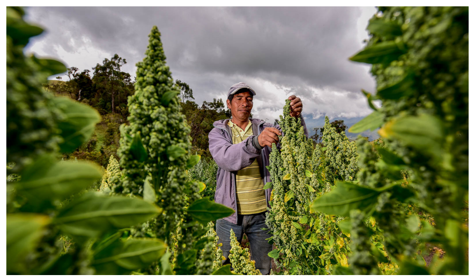
Quinoa in Colombia's Purace Municipality, Cauca Department