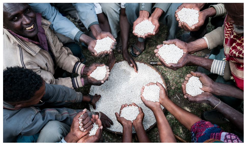
White pea bean in Ethiopia