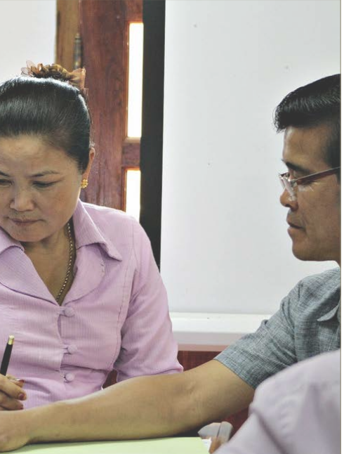
District consultation in the Mekong region

While the Platforms provide a space for different actors to engage with dam planning, facilitating community engagement has been more difficult. Decision makers tend to have a negative attitude towards engaging with local communities, perceiving dialogue with poor people to be