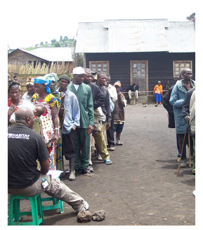
A land mediation centre in eastern-DRC

83Above footnote, p.13 84 Above footnote, p. 31, 48