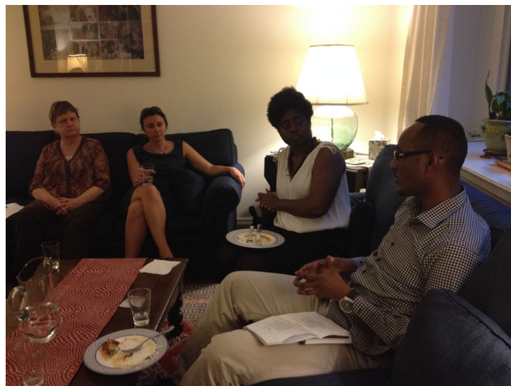
Quakers gather over dinner at Quaker House to learn about civil society peacebuilding efforts in Somalia.

House welcomed Friends from across New York City for an informal dinner and presentation, and on the following day UN staff and NGO representatives were welcomed for a more UN focused discussion on the need for peacebuilding initiatives in Somalia. ❖