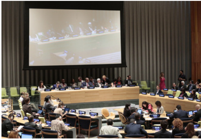
A view of the Trusteeship Council Chamber during the General Assembly's high-level event on "Contributions of North-South, South-South, Triangular Cooperation, and ICT (Information and Communications Technology) for Development to the Implementation of the Post-2015 Development Agenda"