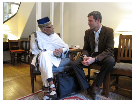
Participants exchange ideas following the “What’s Next in Peacebuilding” discussion.

The “What’s Next in Peacebuilding” discussion was well timed, offering a forum for expert collaboration on peacebuilding policy as several upcoming peacebuilding projects are underway. The opportunity to discuss new sophistication in peacebuilding helps