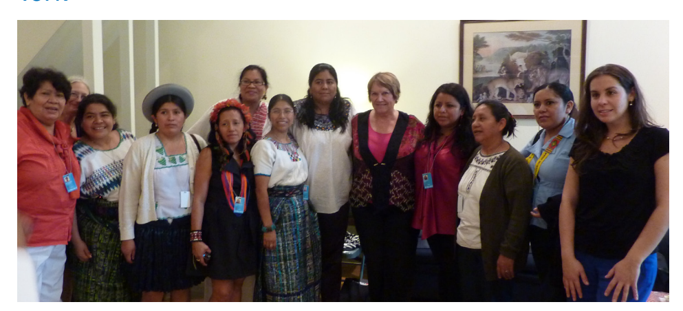
The Organization of American States' Rapporteur on the Rights of Indigenous Peoples and attendees of the Forum gather at Quaker House.

UNO is currently hosting colleagues from Canadian Friends Service Committee (CFSC) while they attend the Twelfth Session of the United Nations Permanent Forum on Indigenous Issues. The forum has certainly brightened up the UN as many of the 2,300 indigenous attendees wear their traditional dress, making a pleasant change to the abundance of suits that normally fill the corridors.