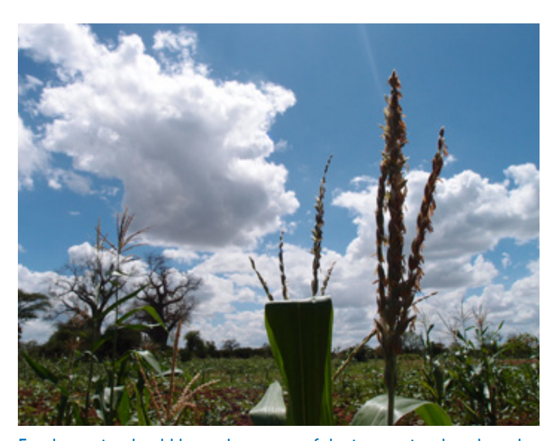
Food security should be at the center of the international trade and investment framework for agriculture.

tem. QUNO Geneva will provide opportunities for governments and civil society to think about alternative ways to govern agricultural trade and investment over the next four years, with a conference scheduled to take place in Geneva in January 2014.