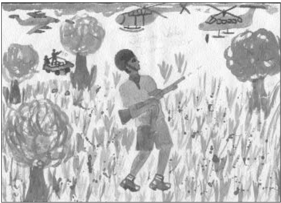
Artwork created by former young soldiers portrays scenes of war