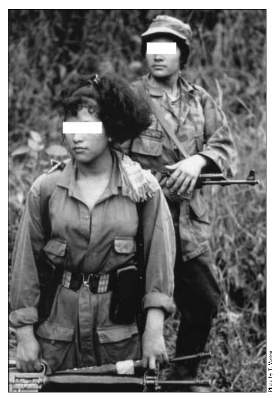
Girls are also involved in active combat