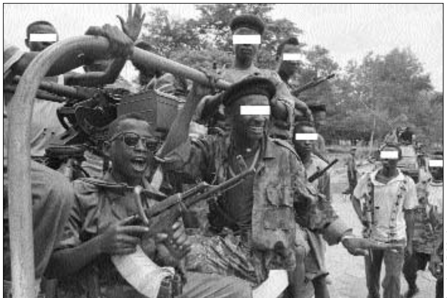
hoto by A.