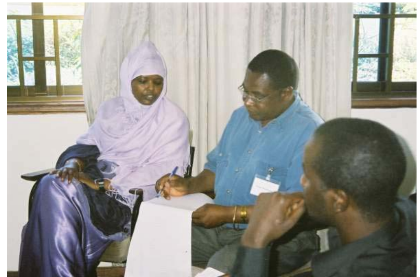
Participants at QUNO’s seminar in Nairobi, April 2004