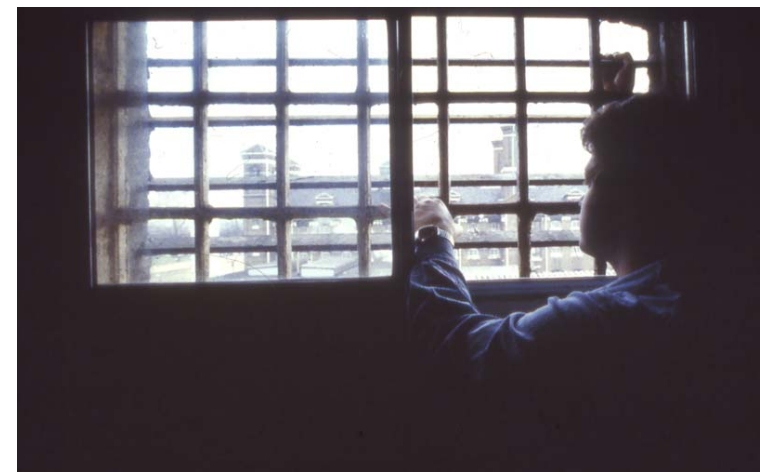
A prisoner looks out from their cell.