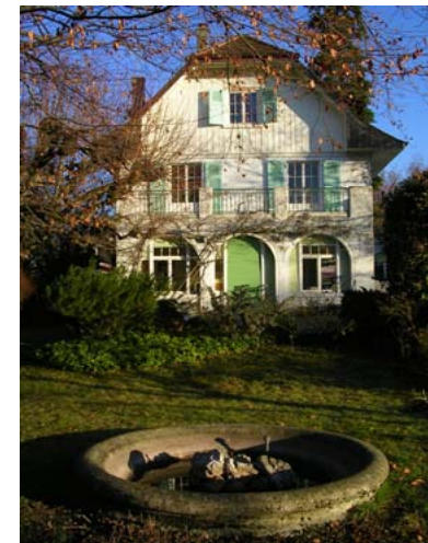
Quaker House